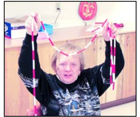
Patrons of the Work Activity Center are proud of the projects they complete.